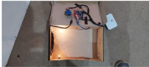
Fig. 4. Turning System Devices