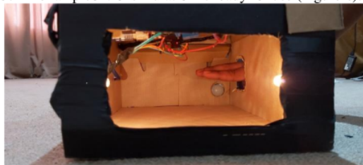
Fig. 6. Simulation Tools used