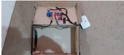
Fig. 5. Simulation device after being idle for 30 seconds