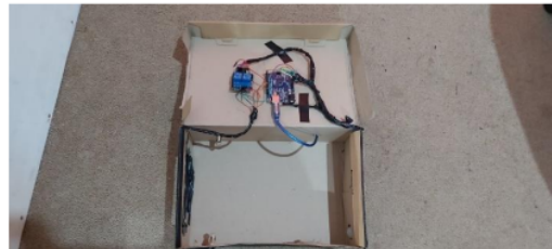
Fig. 3. Simulation of lighting control at the STMIK Hang Tuah Pekanbaru

Implementation is one of the stages in system development, where this stage is the stage of putting the light control system on the STMIK Hang Tuah Pekanbaru campus so that it is ready to operate and can be seen as an effort to realize the system that has been designed. Simulation of lighting control at the STMIK Hang Tuah Pekanbaru is shown in Figure 3.