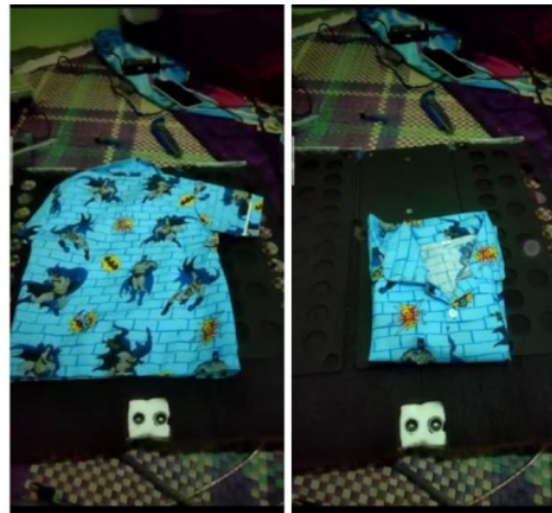
Figure 9. Test Results

After the author has finished testing, the results of the conclusions include the assembly of a clothes folding device in the form of a microcontroller with a servo drive that can be done with a minimum of 3 servo to 6 servos depending on the size requirements of the clothes. There are only 3 servo units and can only lift a small load of clothes, for clothes that are overloaded, it is recommended to add a total of 6 servo, installed on each opposite side of the existing servo placement. This tool can facilitate homework, namely in the work of folding clothes to be more efficient in time and energy.