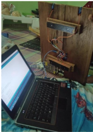
Fig. 4. Tools and Applications

Regarding this, the placement of components on the frame, there are components such as Arduino Uno, Servo A, Servo B, Servo C, UltraSonic Sensor, Power Supply, and other components. All of the components mentioned above are attached behind this wooden axis, starting from the Power Supply which provides electricity to the Arduino Uno and then connected to several components such as ultrasonic sensors, servo A, B, C, so that the function can run smoothly by using this order was studied by Estevez [28]. The process of connecting tools and applications. Figure 4 is the process of coding the application and tools that will be created.