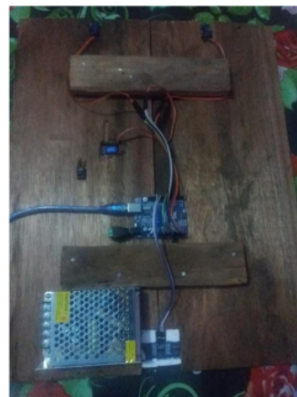
Fig. 3. Component Placement

The wooden frame in Figure 3 is the main frame that will later house the Arduino Uno, Servo A, Servo B, Servo C, UltraSonic Sensors, Power Supply, and other components. All the components mentioned above are attached to a wooden board so that its functionality is more usable was studied by silitonga [27].