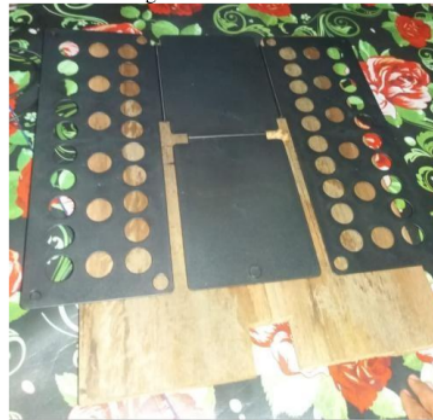
Fig. 2. Wood Frame

The Figure 2 is the framework used by the author to carry out this research using wooden boards.