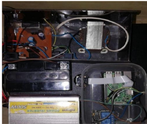
Figure 2 Results of the egg incubator series above

On the inside of the egg incubator, there is a place for laying eggs that has been given a temperature sensor and a heating element. Below the egg laying area is a heating element. The roof of the machine has LEDs to illuminate from inside the machine. For the top series can be seen in Figure 3 below.