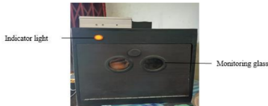
Figure 1 Prototype results of the egg incubator seen from the front

After all the tools and materials are available, you can assemble each component according to the design that has been made. The following is a picture of the assembled prototype: