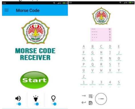
Fig. 1. Home Display and Display Running Process

The system implementation will be described in accordance with the analysis and design described in the previous chapter. After the analysis and design stages have been completed, then the next stage is the implementation of the interface design which aims to explain the implementation of the interface that has been designed so that it is in accordance with the expected. The results of the implementation of the application interface. The home page is the initial display of the system which will be displayed to the user Figure (1).