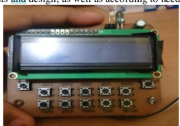
Fig. 2. Tool Display

After the implementation stage is carried out, it is followed by the testing phase (Figure 2). The testing phase is carried out to determine the suitability between the results of the implementation at the predetermined needs analysis. Blackbox testing is carried out to find out whether the system built has been running in accordance with the results of analysis and design, as well as according to needs.