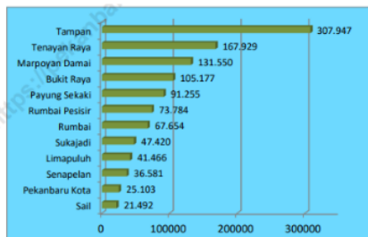
Figure 1. Total Population in 12 Districts in Pekanbaru City.

0 for coliform bacteria and 50 for E.Coli while based on the Regulation of the Minister of Health of the Republic of Indonesia Number 492/2010 regarding drinking water quality requirements (Regulation of the Minister of Health of the Republic of Indonesia No.492, 2010)