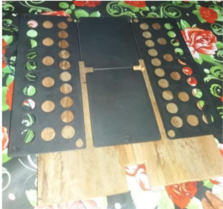
Fig. 2. Wood Frame

The Figure 2 is the framework used by the author to carry out this research using wooden boards.