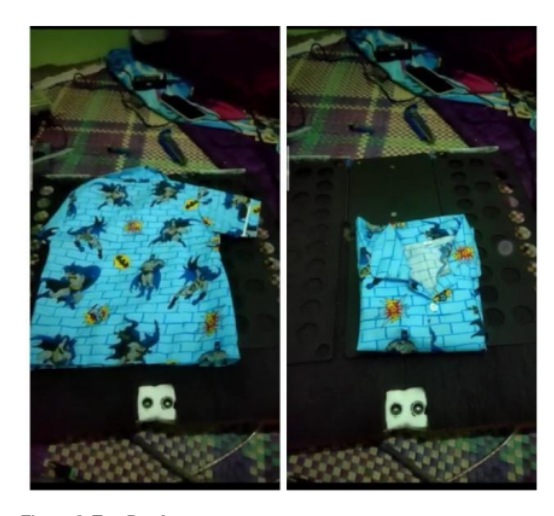
Figure. 9. Test Results

After the author has finished testing, the results of the conclusions include the assembly of a clothes folding device in the form of a microcontroller with a servo drive that can be done with a minimum of 3 servo to 6 servos depending on the size requirements of the clothes. There are only 3 servo units and can only lift a small load of clothes, for clothes that are overloaded, it is recommended to add a total of 6 servo, installed on each opposite side of the existing servo placement. This tool can facilitate homework, namely in the work of folding clothes to be more efficient in time and energy.