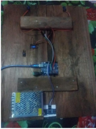
Fig. 3. Component Placement

The wooden frame in Figure 3 is the main frame that will later house the Arduino Uno, Servo A, Servo B, Servo C, UltraSonic Sensors, Power Supply, and other components. All the components mentioned above are attached to a wooden board so that its functionality is more usable was studied by silitonga [27].