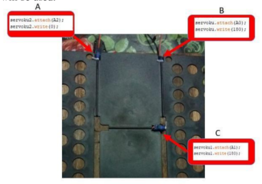
Fig. 6. Servo Coding

Testing the coding used in Figure 6 is an explanation of the coding that will be used on the component devices that will be used: