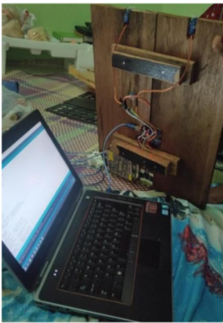
Fig. 4. Tools and Applications

Regarding this, the placement of components on the frame, there are components such as Arduino Uno, Servo A, Servo B, Servo C, UltraSonic Sensor, Power Supply, and other components. All of the components mentioned above are attached behind this wooden axis, starting from the Power Supply which provides electricity to the Arduino Uno and then connected to several components such as ultrasonic sensors, servo A, B, C, so that the function can run smoothly by using this order was studied by Estevez [28]. The process of connecting tools and applications. Figure 4 is the process of coding the application and tools that will be created.