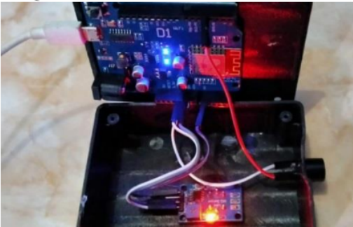
Fig.4. System Device Turns On

2. After that the LPG gas leak detection system will turn on like its supporting devices, namely Wemos D1, Sensor MQ-6.