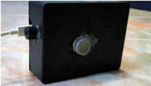
Fig. 3. The device is connected to an electric current

2. After that the LPG gas leak detection system will turn on like its supporting devices, namely Wemos D1, Sensor MQ-6.